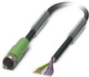
Sensor/Actuator cable, 8-position, PUR, Black RAL 9005, Free cable end, on Socket straight M8, Cable length: 10 m

Please be informed that the data shown in this PDF Document is generated from our Online Catalog. Please find the complete data in the user's documentation. Our General Terms of Use for Downloads are valid ( http://download.phoenixcontact.com )