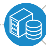
Asset Management Platform