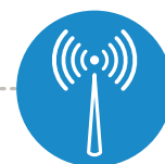
Wireless Service Provider