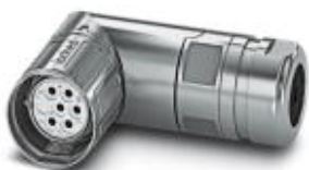
The figure shows the 6-pos. product version

Cable connector, angled, shielded: yes, SPEEDCON locking, M23, No. of pos.: 7, type of contact: Socket, Crimp connection, cable diameter range: 4 mm ... 6 mm