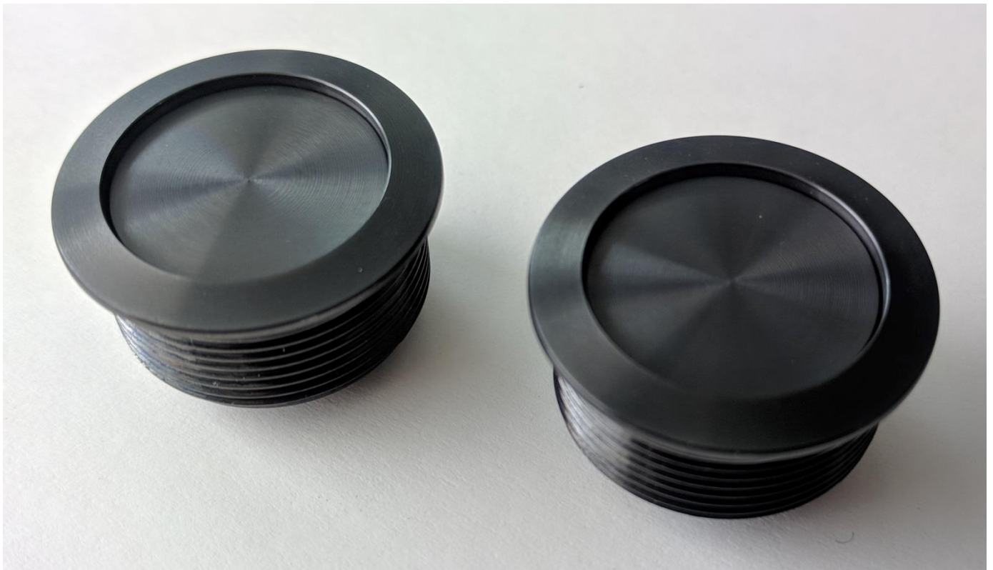
Note: These samples are not MCS19, but show the same surface colour appearance as MCS19 would.

Appearance Stainless Steel with black PVD treatment: