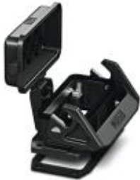
HEAVYCON EVO panel mounting base, plastic, B16, with single locking latch, height: 30.5 mm, with flat gasket, with protective cover

Please be informed that the data shown in this PDF Document is generated from our Online Catalog. Please find the complete data in the user's documentation. Our General Terms of Use for Downloads are valid ( http://download.phoenixcontact.com )