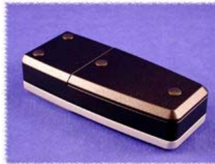
click to enlarge Assembled View (Bottom)