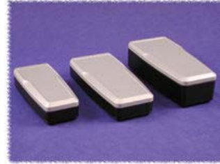
click to enlarge (Group View)