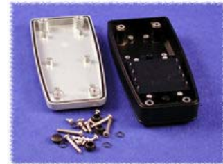
click to enlarge Open View (Top)