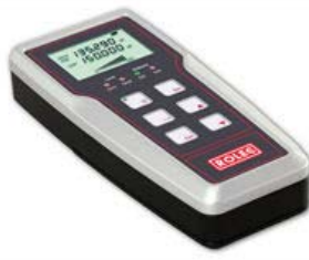
click to enlarge (Application Example)