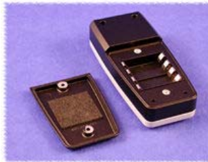
click to enlarge Open View (Bottom)