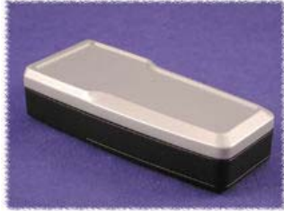
click to enlarge (Assembled View)

Path: Home > Enclosure Index > MOREnclosures > ROLEC - Sealed - Diecast Aluminum HandCase