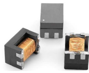
AE2002 – 100Base-T1