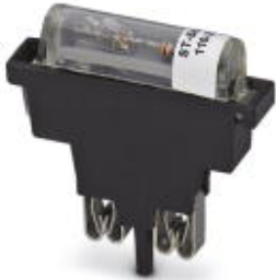
The figure shows a similar product

Fuse plug, Nominal current: 6.3 A, Length: 45.4 mm, Width: 9.9 mm, Color: black