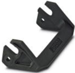
Single locking latch for B16 housing, HC-EVO....AL and HC-STA....AL

Please be informed that the data shown in this PDF Document is generated from our Online Catalog. Please find the complete data in the user's documentation. Our General Terms of Use for Downloads are valid ( http://phoenixcontact.com/download )