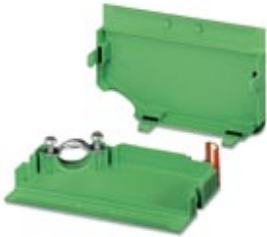
Cable housing, Pitch: 5 mm, Number of positions: 20, Dimension a: 100 mm, Color: green

Please be informed that the data shown in this PDF Document is generated from our Online Catalog. Please find the complete data in the user's documentation. Our General Terms of Use for Downloads are valid ( http://download.phoenixcontact.com )