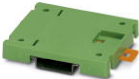
The illustration shows version EM-MP 45 N

Mounting plate, for screwing on siz 0 switchgear