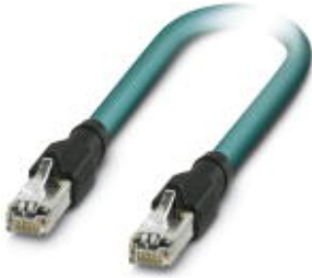
Patch cable, CAT5e, 4-pair, shielded, line, assembled at both ends with straight RJ45/IP20 heads, length: 0.3 m

Please be informed that the data shown in this PDF Document is generated from our Online Catalog. Please find the complete data in the user's documentation. Our General Terms of Use for Downloads are valid ( http://download.phoenixcontact.com )