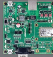
xPico 110 Evaluation Board