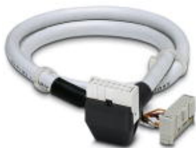
Round cable set for SIMATIC® TOP connect with 1 x IDC/FLK socket strip (16-position) on 1 x IDC/FLK socket strip (14-position), Cable length: 5 m

Please be informed that the data shown in this PDF Document is generated from our Online Catalog. Please find the complete data in the user's documentation. Our General Terms of Use for Downloads are valid ( http://phoenixcontact.com/download )