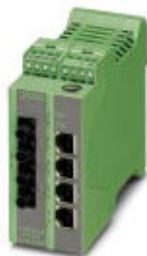
Ethernet Lean Managed Switch with four 10/100 Mbps RJ45 ports and two 100 Mbps FX-ST multi-mode ports

Please be informed that the data shown in this PDF Document is generated from our Online Catalog. Please find the complete data in the user's documentation. Our General Terms of Use for Downloads are valid ( http://phoenixcontact.com/download )