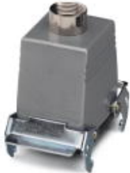
The illustration shows version HC-D 50-KMQ-76/M 1 PG 21

HEAVYCON coupling housing D50, with double locking latch, height 76 mm, with support 1xM25