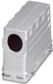
HEAVYCON sleeve housing B24, for double locking latch, height 76 mm, with thread M40, lateral cable outlet, EMC version

Please be informed that the data shown in this PDF Document is generated from our Online Catalog. Please find the complete data in the user's documentation. Our General Terms of Use for Downloads are valid ( http://download.phoenixcontact.com )