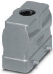
HEAVYCON B16 sleeve housing, for double locking latch, height: 65 mm, with 1 x M32 thread, straight cable outlet

Please be informed that the data shown in this PDF Document is generated from our Online Catalog. Please find the complete data in the user's documentation. Our General Terms of Use for Downloads are valid ( http://phoenixcontact.com/download )