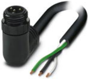
Power cable, 3-position, PVC, black, Plug angled 7/8"-16UNF, A - standard, on free cable end, A - standard, cable length: 10 m

Please be informed that the data shown in this PDF Document is generated from our Online Catalog. Please find the complete data in the user's documentation. Our General Terms of Use for Downloads are valid ( http://phoenixcontact.com/download )