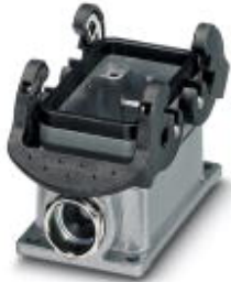
Box mounting base, with double locking latch, height 52 mm, with screw connection, 2x Pg16

Please be informed that the data shown in this PDF Document is generated from our Online Catalog. Please find the complete data in the user's documentation. Our General Terms of Use for Downloads are valid ( http://phoenixcontact.com/download )