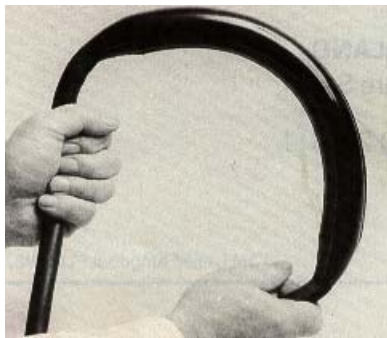
Excellent flexibility in completed joint.