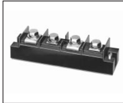
CM530820 Dual SCR POW-R-BLOK™ Modules 200 Amperes/800 Volts