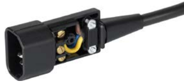
Example with assembled cable