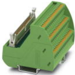
The illustration shows a 50-pos. version

Please be informed that the data shown in this PDF Document is generated from our Online Catalog. Please find the complete data in the user's documentation. Our General Terms of Use for Downloads are valid ( http://download.phoenixcontact.com )