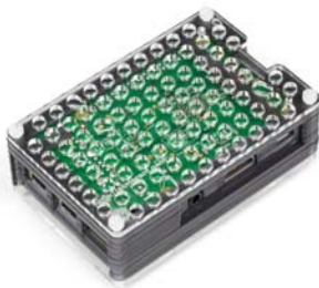
LEGO® compatible base PIM065