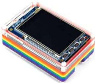
PiTFT Plus layers PIM092