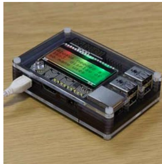
Display-O-Tron 3000 top PIM093