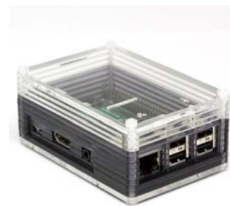
Height extension PIM060