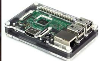
Coupé Heatsink top PIM167

Need to adapt your Pibow to fit your project? These handy extension layers will sort you out!