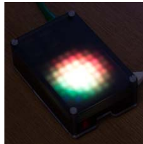
Ninja diffuser PIM064