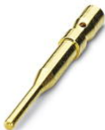
Crimp contact, turned, contact diameter: 1 mm, crimp range: 0.08 mm 2 ... 0.22 mm 2

Please be informed that the data shown in this PDF Document is generated from our Online Catalog. Please find the complete data in the user's documentation. Our General Terms of Use for Downloads are valid ( http://phoenixcontact.com/download )