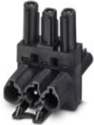
T-distributor with 2 sockets and one connector for series connection, black, 3-pos.

Please be informed that the data shown in this PDF Document is generated from our Online Catalog. Please find the complete data in the user's documentation. Our General Terms of Use for Downloads are valid ( http://phoenixcontact.com/download )