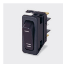
☐ C6010AL - - -