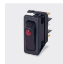
☐ C6003PL - - -