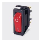
☐ C6003AL - - -