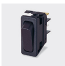
☐ C6000AL - - -