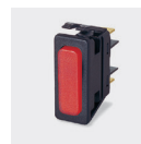
☐ C6030AL - - -