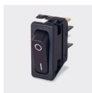
☐ C6000AL - - -