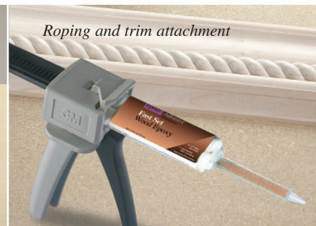
Roping and trim attachment