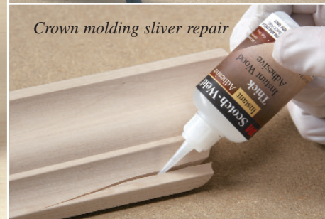
Crown molding sliver repair