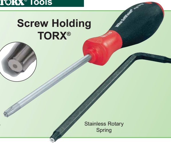
Stainless Rotary Spring