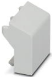
Filler plugs, for unoccupied terminal points

Please be informed that the data shown in this PDF Document is generated from our Online Catalog. Please find the complete data in the user's documentation. Our General Terms of Use for Downloads are valid ( http://phoenixcontact.com/download )