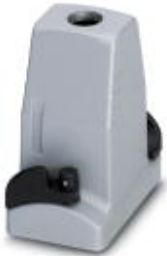
HEAVYCON ADVANCE EMV sleeve housing B6, with bayonet locking, height 100 mm, with 1xM25 thread, straight cable outlet

Please be informed that the data shown in this PDF Document is generated from our Online Catalog. Please find the complete data in the user's documentation. Our General Terms of Use for Downloads are valid ( http://download.phoenixcontact.com )